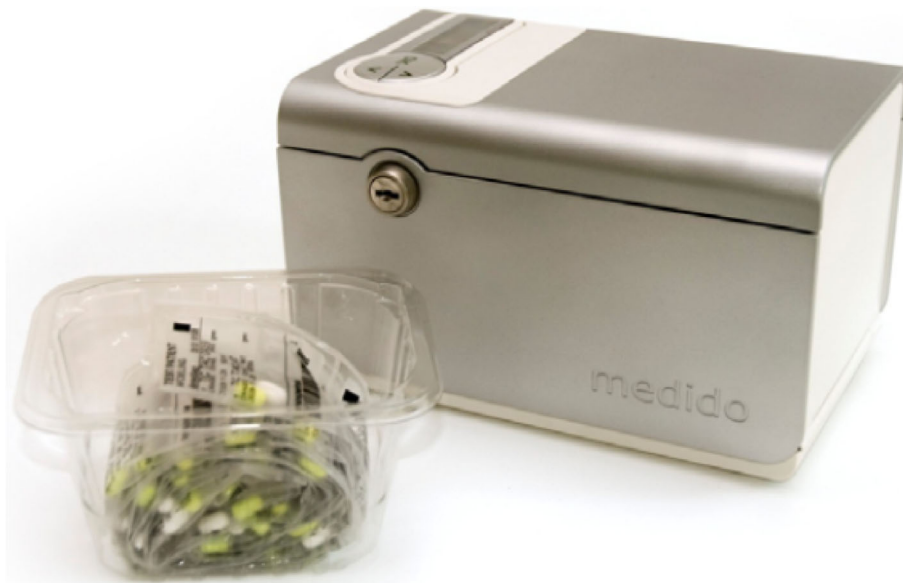
Fig. 1 The Medido medication dispenser. Source: Innospense®. Image freely available