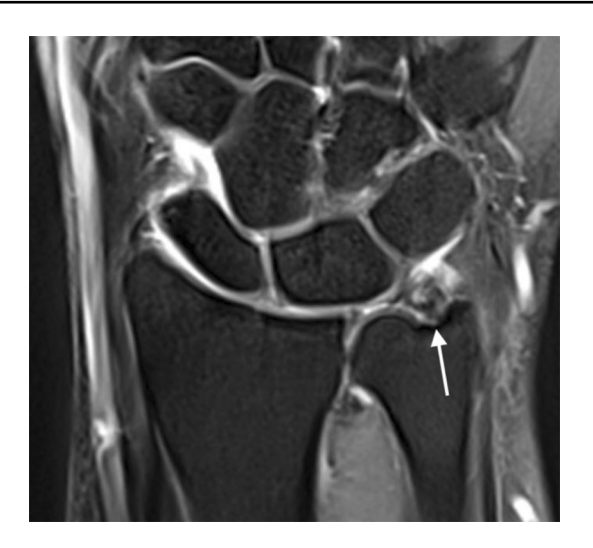
Fig. 1 Coronal T2-weighted wrist MRI showing a TFCC tear (arrow)