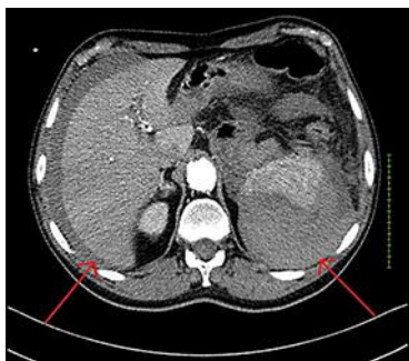
Fig. 1. CT scan of the abdomen. Perisplenic and perihepatic haematoma due to splenic injury (red arrows).